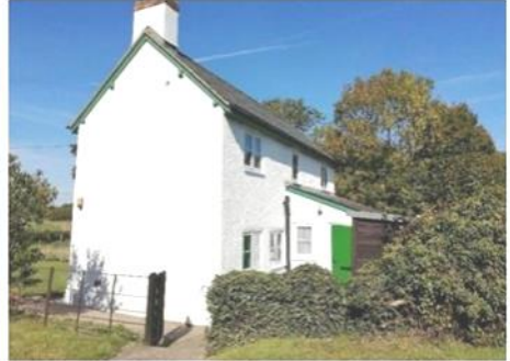
Albion Hayes Our Holiday Cottage and Residential Rural Cottages to let near Shrewsbury and Bomere Heath